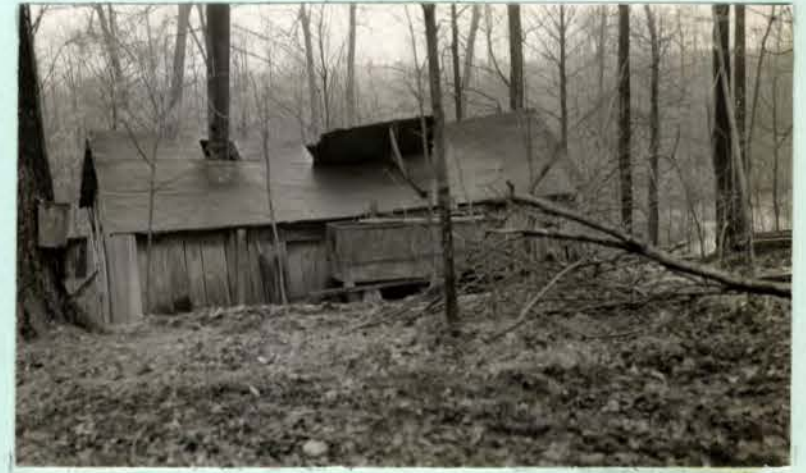
The Sugar Shanty