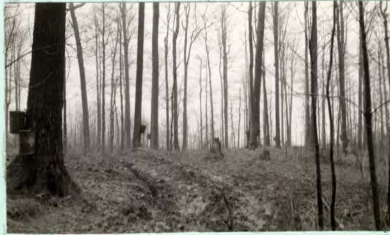
The Maple Bush